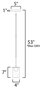
*max overall height

Cylinders in Clear Seeded glass on simple Satin Nickel frames or matte Black frames with Antiqued Brass socket covers. Pivoting arms on chandelier allow it to direct light up or down. Use filament lamps either tubular or Edison in shape for a Coastal or Industrial look, or use a traditional A19 to create a more transitional look. A full range of affordable lighting for the kitchen, dining room, bathroom, or bedroom that easily complements fashionable finishes and lasting styles.